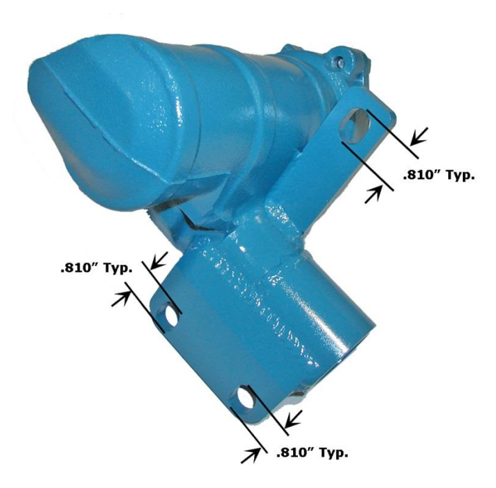
Pic1: Modified mounting holes

Applies to 67-76 A-body applications only: DIY modification required to the units mounting holes. The three mounting holes must be elongated to .810" to allow the steering unit to be moved away from the engine for adequate clearance from the header tubes.