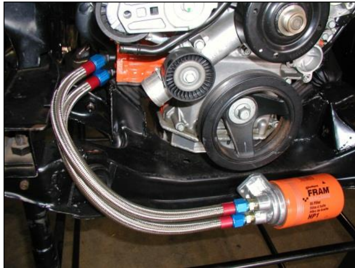
Remote filter mounted for illustration purposes only. Mount your filter to suit your application.

2 Remote Mount Oil Filter Kit available through Milodon - Part #21560 (Not available through TTI)