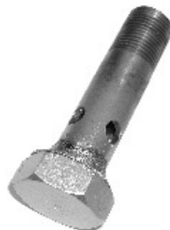
Large stock 90° oil filter adapter bolt (1-3/16") hex head.