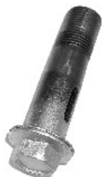
Small stock 90° oil filter adapter bolt (3/4") hex head.

Must use small stock 90° oil filter adapter hex head bolt (3/4") or modify the large 90° oil filter adapter hex head bolt (1-3/16") by matching to .175 thickness.