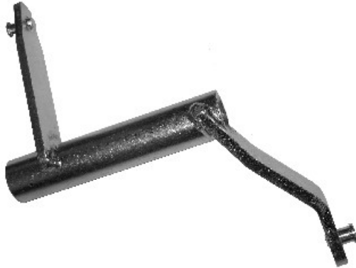
Z-Bar P/N: ZB307