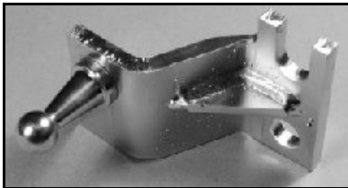
Brewer's Performance Unmodified Bellhousing Ball Stud Bracket # BSB271