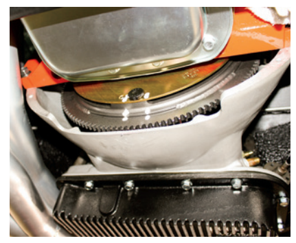
The previously mentioned white paint marks came in handy to easily line up the converter to flexplate bolts into their respective holes. Here, we also used ARP bolts (ARP-240-7302, Summit, $10.99) to handle the Hemi's torque for no fear of fastener failure