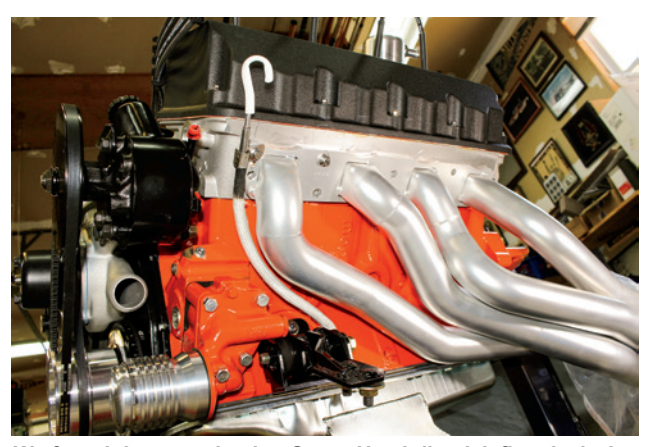
We found the reproduction Street Hemi dipstick fits nicely. It only required minor bending to provide good clearance away from the ceramic-coated TTI 2 1/4-inch headers (PN HEMI625-214C4, TTI, $977) and Schumacher Creative Services conversion Hemi engine mounts (PN B625H, Schumacher, $259).