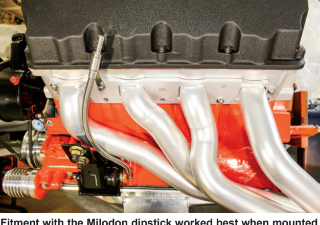
Fitment with the Milodon dipstick worked best when mounted and routed as seen here. Routing/mounting it any differently made pulling and putting in the dipstick very difficult, if not impossible.

Here's where the good folks from TTI Exhaust and Schumacher Creative Services come to the rescue. They address these differences and help make your Hemi dream a reality. Unlike before, there's no need to search and purchase an expensive Hemi K-member and engine mounts.