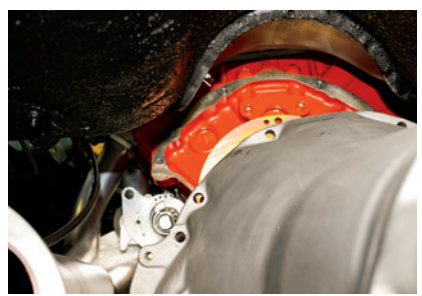
To make life easier, and this is for all classic Mopar V-8s with headers, put the starter in its place resting on the header tubes (as seen) before bolting the transmission or bellhousing to the block.

With the engine back in place, there was roughly 1/4-inch clearance after dimpling the header, plus we shaved a 1/16-inch off the new Borgeson power steering box. The Borgeson power steering box was touched up with Eastwood Rust Encapsulator, where it was shaved.