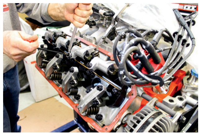
We decided it would be easier to check and set the valve lash on our Street Hemi before dropping it into the tight-fit engine bay. Hemi valve covers — especially our taller and wider Ray Barton units, are easier to remove and reinstall while on the engine stand. Check out the Ray Barton rocker system. It has valvetrain stability up to 10,000 rpm.