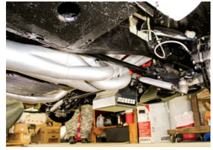
There's lots of clearance around all of the steering components and the PST 1.03-inch torsion bars we featured in a previous story, "Mopar Front Suspension Rehab: Get Handling With Stock Looks!" The prior dimpling of the number four header tube gave us a good ¼ inch of clearance of the T-bar.

Surprisingly, all-around clearances are better with the TTI 2½-inch Hemi than the TTI 2-inch headers in my 440-powered '67 Coronet R/T. Access to wrench bolts and install accessories are better too. We coated the trans crossmember with Eastwood's 2K Ceramic Aerosol Chassis Black (PN 14146Z, Eastwood, $24.99) and the undercarriage with Chassis Black (PN 10043ZP, Eastwood, $34.99 quart) for a clean, cool look.