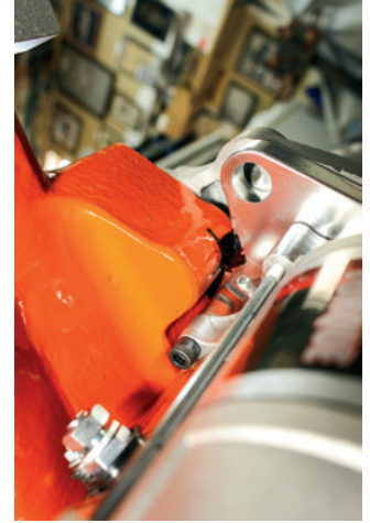
The newer Mopar Gen II Hemi blocks are beefier than the original factory castings. To line up the starter boltholes, we'd need to clearance grind the block or starter. TTI Exhaust recommends use of this clock-able Powermaster XS Torque starter (PN PWM-9523, Summit, $308.99) for fitment with their headers.

Though swaps to the Gen III Hemi engines are gaining popularity, we're happy to go the old-school route for simplicity's sake. Let's not forget all the technology that in recent years has gone into the Gen II Hemi. Whoever thought 10-plus years ago you could have a pump-gas, naturally aspirated Street Hemi