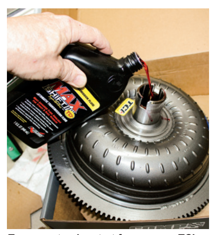
To prevent a dry start for our new TCI torque converter, we poured in a quart of TCI's Max Shift synthetic ATF. We coated the converter's snout with ATF to prevent possible damage to the T-Flite's new front seal.

ARP crankshaft bolts (PN ARP-200-2905, Summit, $33.95) were used to secure the TCI solid flexplate. The ARP fasteners received three steps of torque (40 to 60 to 85 ft-lb) in a crisscross torque sequence pattern.