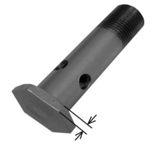
Machine to .175 thickness